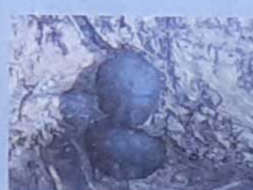
King Alfred's Cake Fungus