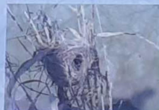
Harvest Mouse Nest